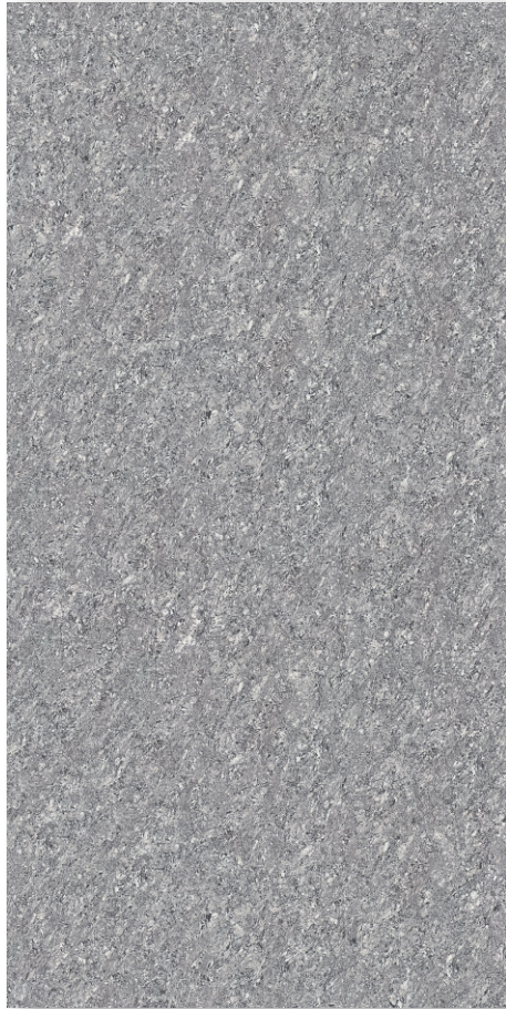
CENTURY SMOKE GREY